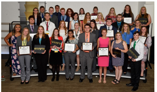
2018 State Award winners in the senior division with their plaques at 4-H Exploration Days.

Michigan 4-H true leaders ages 11 and older have an opportunity to be recognized for the great work they do in 4-H by completing a state award application. A Michigan 4-H State Award is the highest honor bestowed on a Michigan 4-H member and provides an opportunity to receive